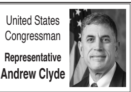
United States Congressman Representative Andrew Clyde

B o m b s h e l l IRS Whistleblower Testimony - As you may know, two IRS whistleblowers pulled back the curtain on the federal investiga- tion into Hunter Biden